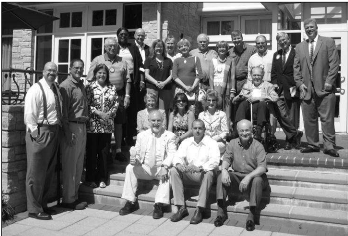
Members enjoy a sunny day at one of our outdoor meetings

The Rotary Club of Hunt Valley Rotary will be directing Program Ad sales for the 2009 Legacy Chase at Shawan Downs to be held on Saturday, September 26. In addition to supporting the Land Preservation Trust, proceeds will go to the James W. Houck Foundation, our 501(c)(3), and directly support our Four-Way Test Program, local charities, and international service projects. Please email Support@HuntValleyRotary.com for more info.